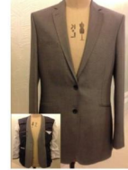
Item: Mens Blazer Fabric: 65% Poly 35% Viscose FOB: