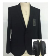
Item: Mens Blazer Fabric: 65% Poly 35% Viscose