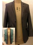
Item: Mens Blazer Fabric: 65% Poly 35% Viscose FOB: