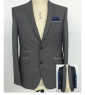
Item: Mens Blazer Fabric: 65% Poly 35% Viscose FOB: