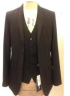
Item: Mens Blazer with vest Fabric: 65% Poly 35% Viscose FOB: