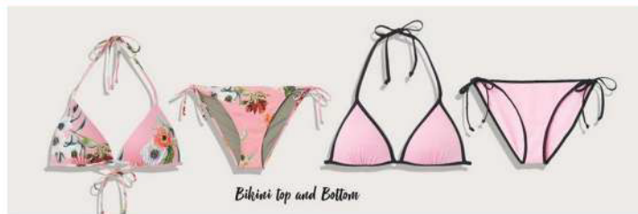
Bikini top and Bottom