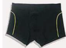
Synthetic boxer and Trunk