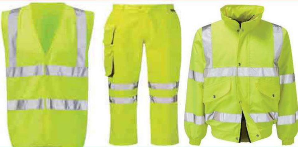
HIGH VIS/WORK WEAR