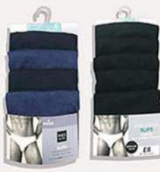
4 and 5 Pack