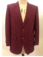
Item: Boys Blazer for school uniform Fabric: 100% Polyester